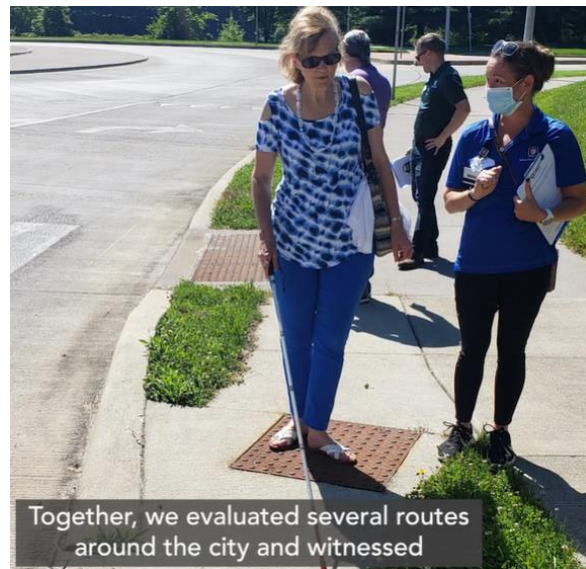
Together, we evaluated several routes around the city and witnessed

engineers, planners, city officials, people with disabilities and others to listen to a keynote speaker on common pedestrian access barriers and innovative ways to address them. Together groups navigated and evaluated several routes around the city and witnessed directly many of the challenges people with disabilities face in our community.