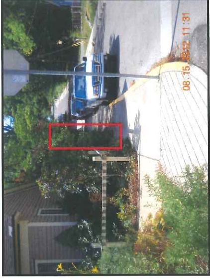
Jackson St, looking West

This violation requires your immediate attention. You are required to abate this violation within ten (10) days of the date of this Notice of Violation. Failure to abate this violation within the allotted time may result in one or more of the following actions being taken: