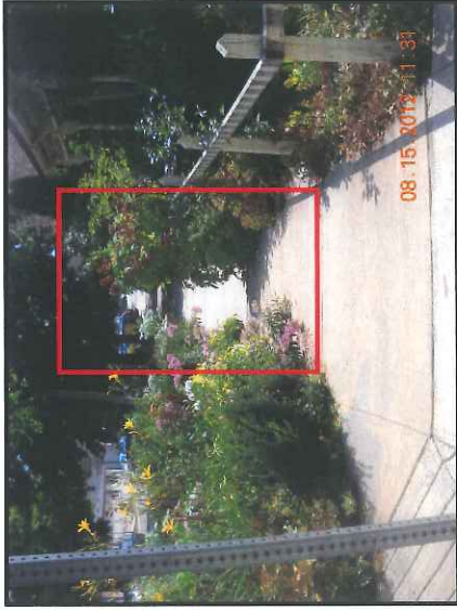
4th St, looking East

Findings: On 08/14/2012, City Engineering received a complaint that the sidewalk was blocked by bushes. A site visit on 08/15/2012 (see photos) revealed that the bushes and flowers in the Right-of-Way belonging to the property located at 521 W 4 th Street were hanging over the sidewalk to an extent that has made the use of the sidewalk difficult to pedestrians. A minimum clearance of 8 feet is required over the sidewalk and the current condition is in violation of Bloomington Municipal Code 12.24.040. All bushes and flowers must be cut back to the edge of the sidewalk.