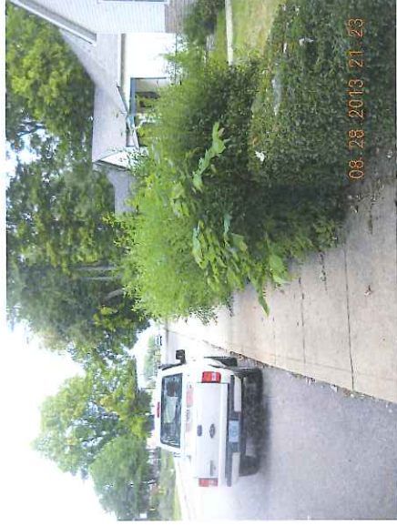
Rogers St, looking North

This violation requires your immediate attention. You are required to abate this violation within ten (10) days of the date of this Notice of Violation. Failure to abate this violation within the allotted time may result in one or more of the following actions being taken: