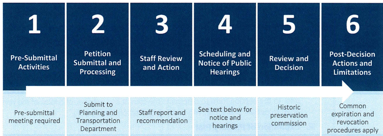
Figure 06.05-4: Summary of Demolition Delay Permit Procedure

Figure 06.05-4 identifies the applicable steps from 20.06.040 (Common Review Procedures) that apply to demolition delay permit review. Additions or modifications to the common review procedures are noted below.