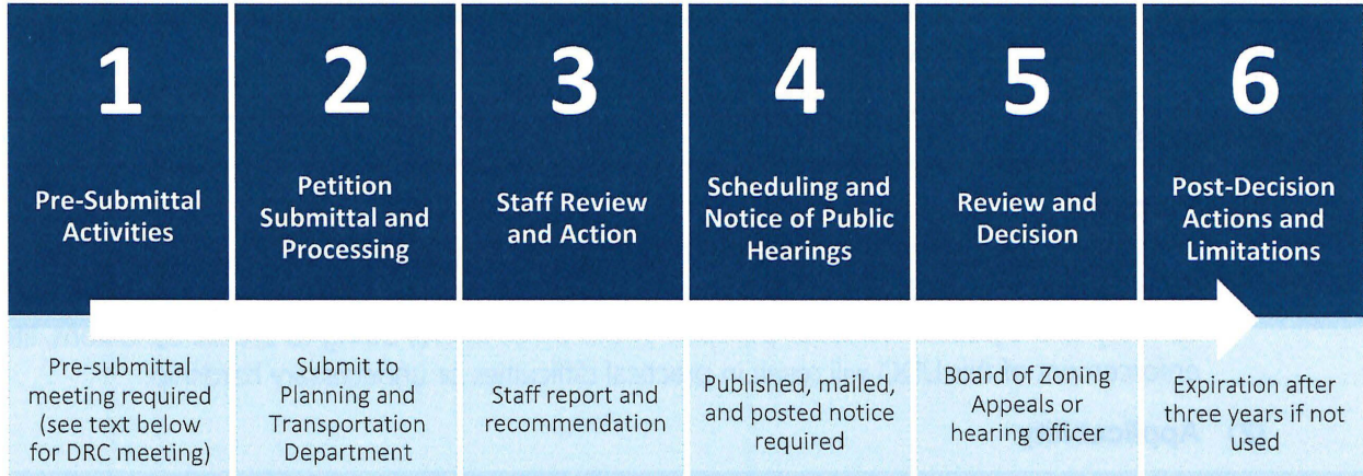
Figure 06.08-1: Summary of Variance Procedure

Figure 06.05-3 identifies the applicable steps from 20.06.040 (Common Review Procedures) that apply to variance review. Additions or modifications to the common review procedures are noted below.