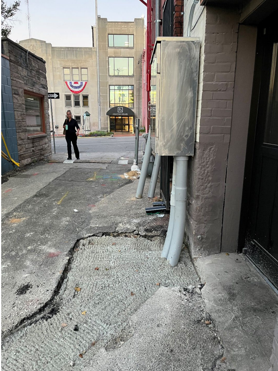
Newly installed Duke power box from 8/31/23