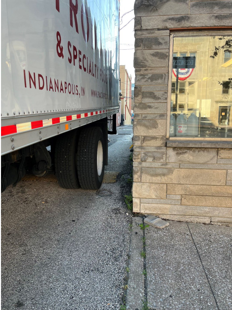
Alley looking east toward S. Washington St. delivery vehicle parking in the alleyway. (2/2)