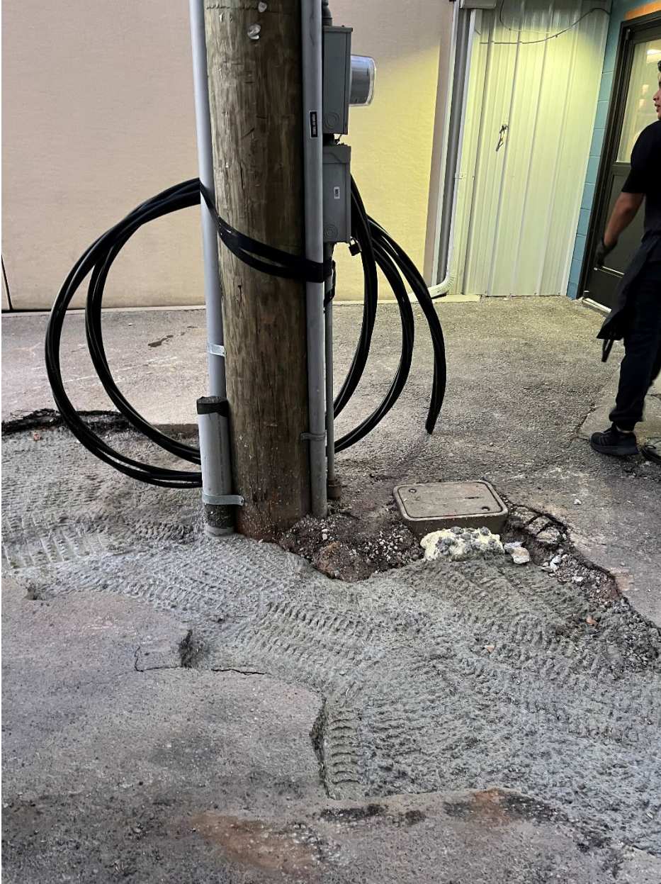
Newly installed Duke power lines from 8/31/23