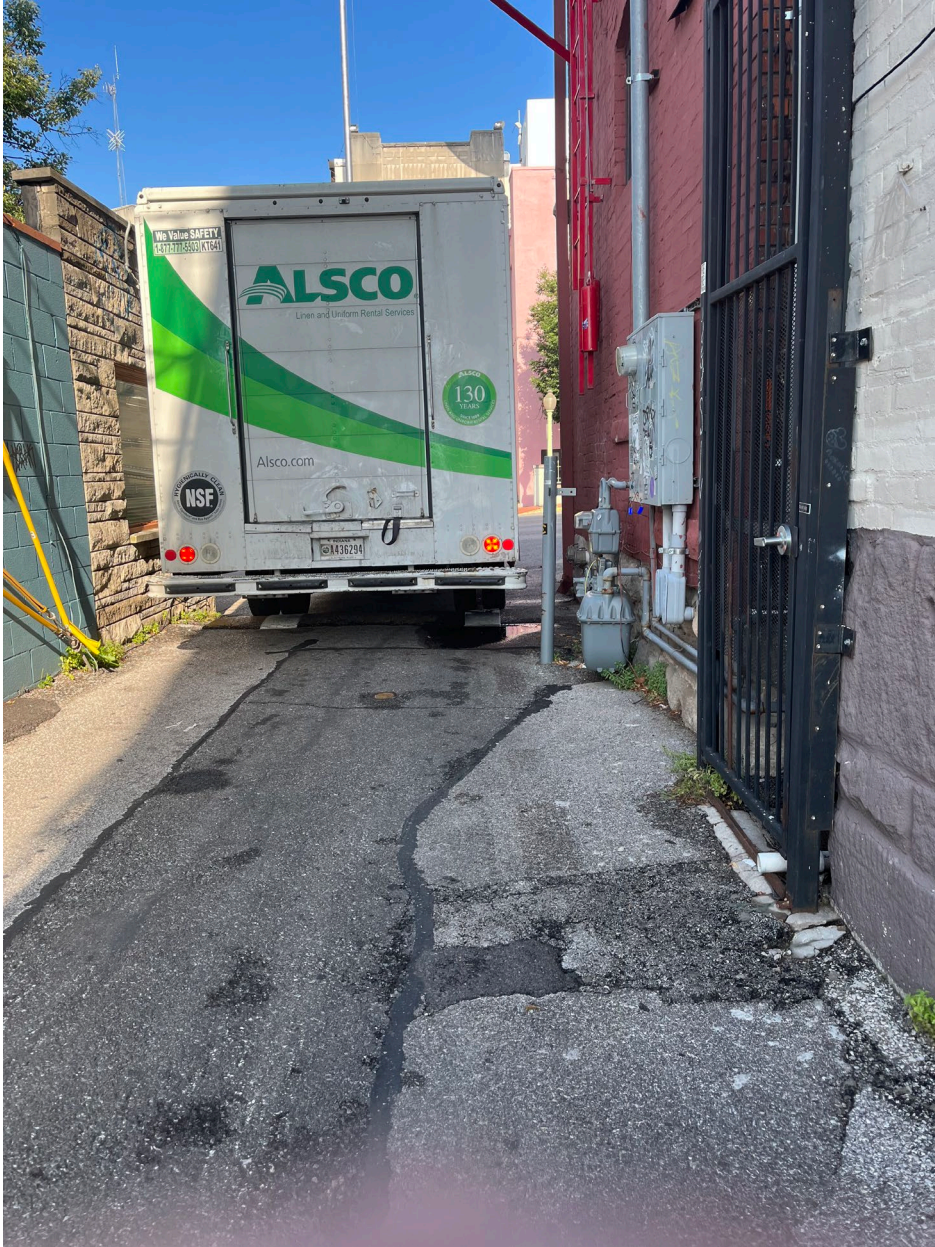
Alley looking west toward S. Walnut St. delivery vehicle parking in the alleyway.