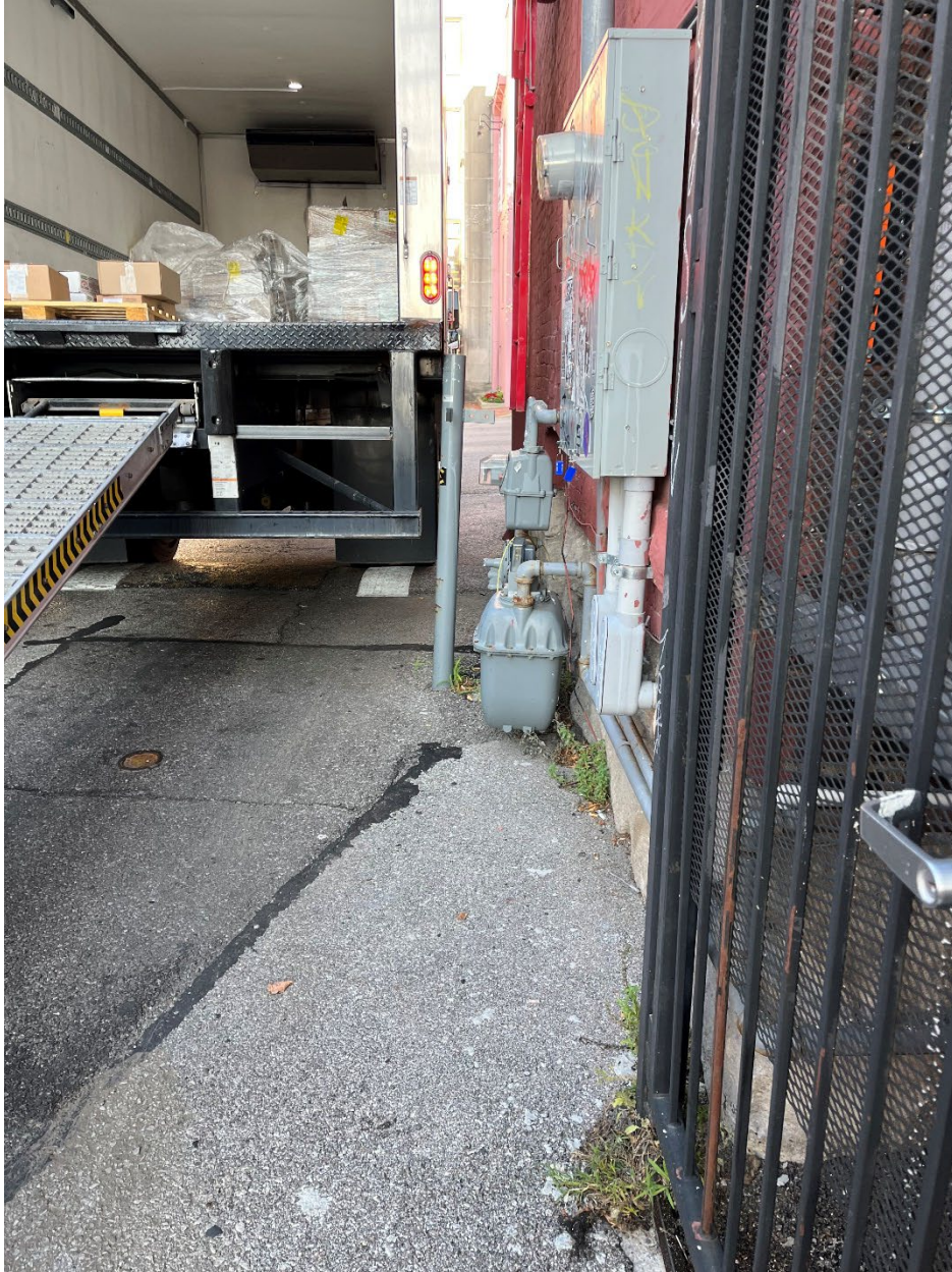
Alley looking west toward S. Walnut St. delivery vehicle parking in the alleyway. (1/2)