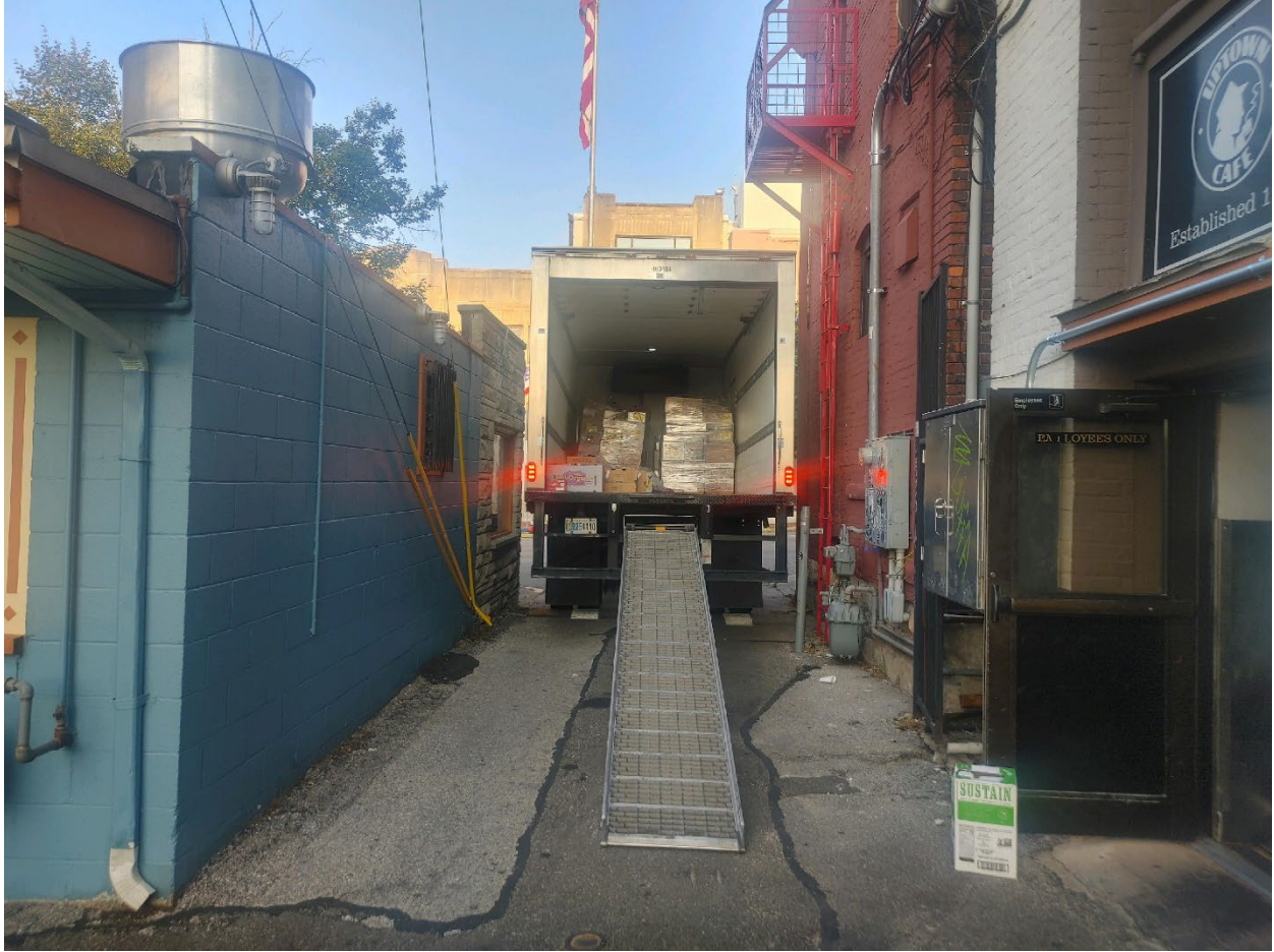
Alley looking west toward S. Walnut St. delivery vehicle parking in the alleyway.