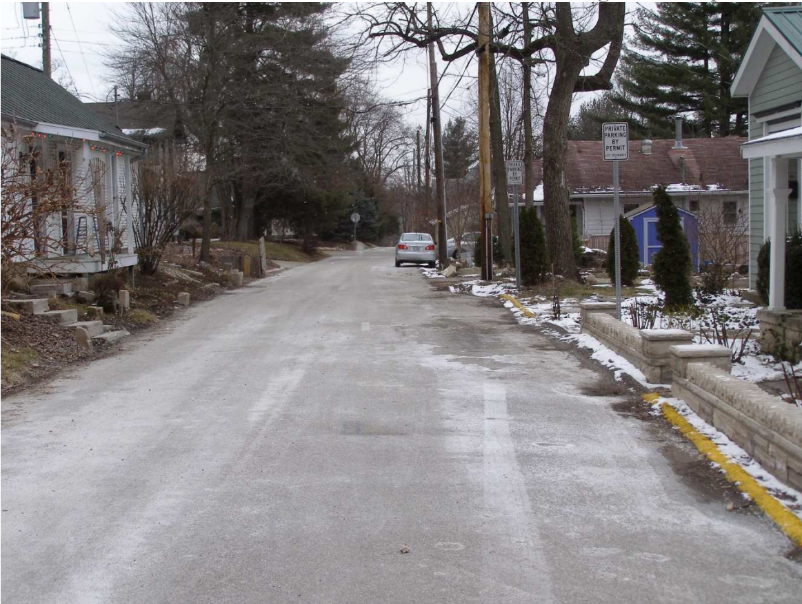
Smith Avenue at the intersection of Jackson Street, looking east towards Rogers Street.