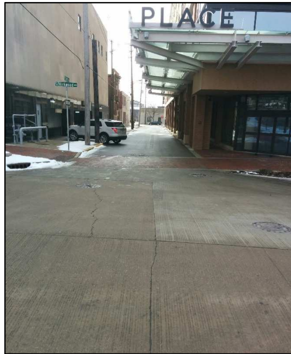
Photos: (left) Gentry Street, looking north from 4 th Street; (right) Gentry Street, looking south from Kirkwood Avenue.