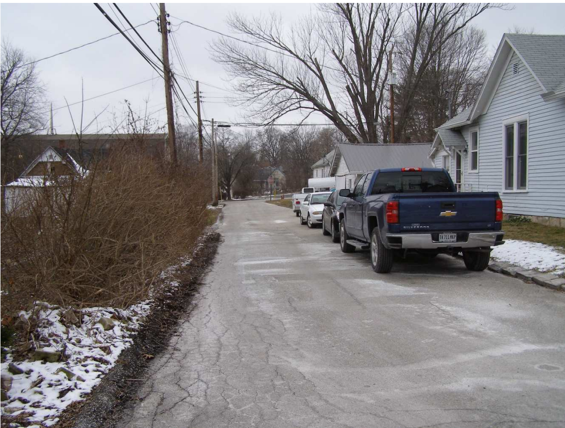
Smith Avenue at the intersection of Jackson Street, looking west.