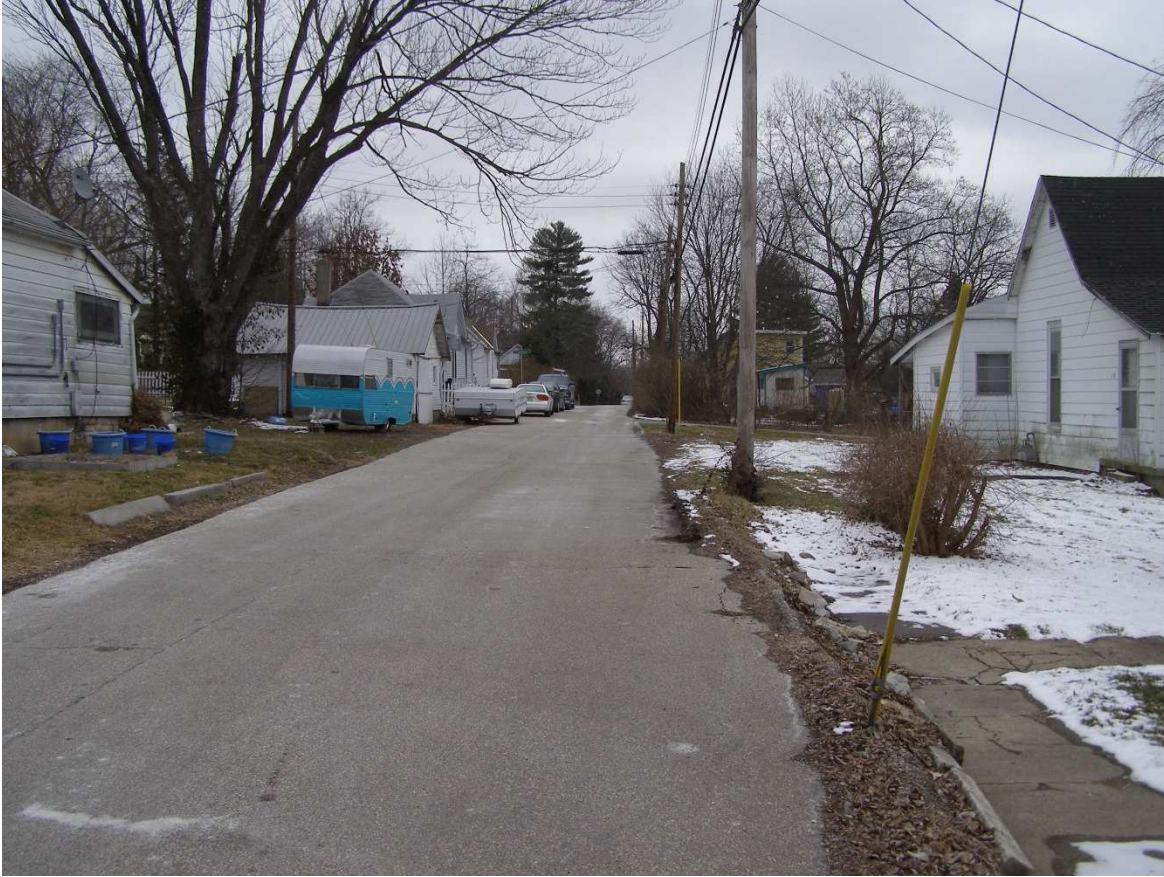
Smith Avenue looking east from S. Fairview Street.