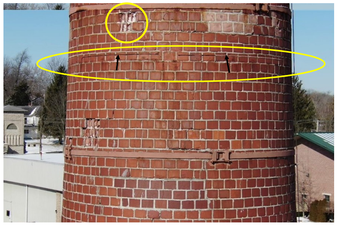
Photo 4 Photo taken in 2022. Band 35 is gone. Remnants of sealant at the top of the band are highlighted as is a new spall.