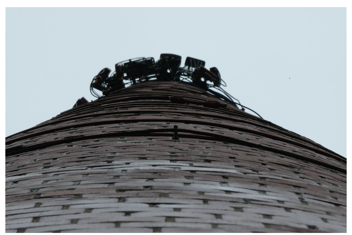
Photo 2 Looking up the wall of the stack on the opposite side as Photo 1.