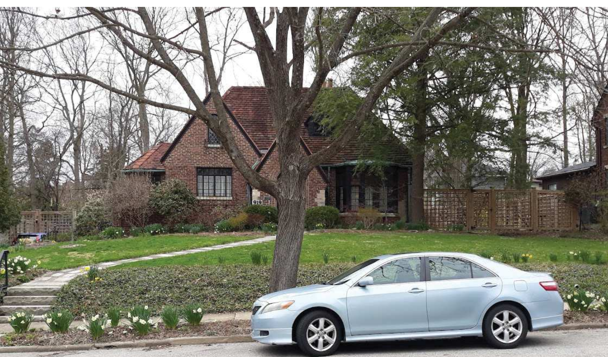
Trellis Fence Precedent 919 E University St.