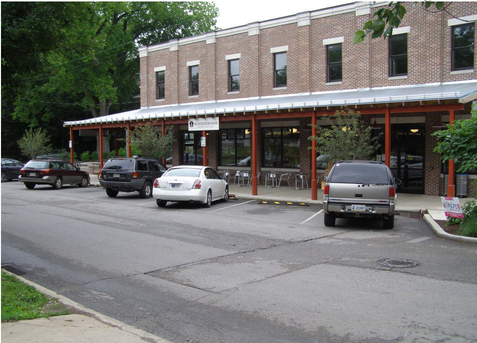
A view of the eleven on-street parking spaces, looking south along E. 2nd Street

Recommendation: Staff recommends changing the current day and time parking regulations for the eleven on-street parking spaces on the south side of E. 2nd Street (between Fess Avenue and 170' west of Fess Avenue) to a new enforcement period of 1 hour parking between 8:00 AM and 10:00 PM, Monday through Saturday.