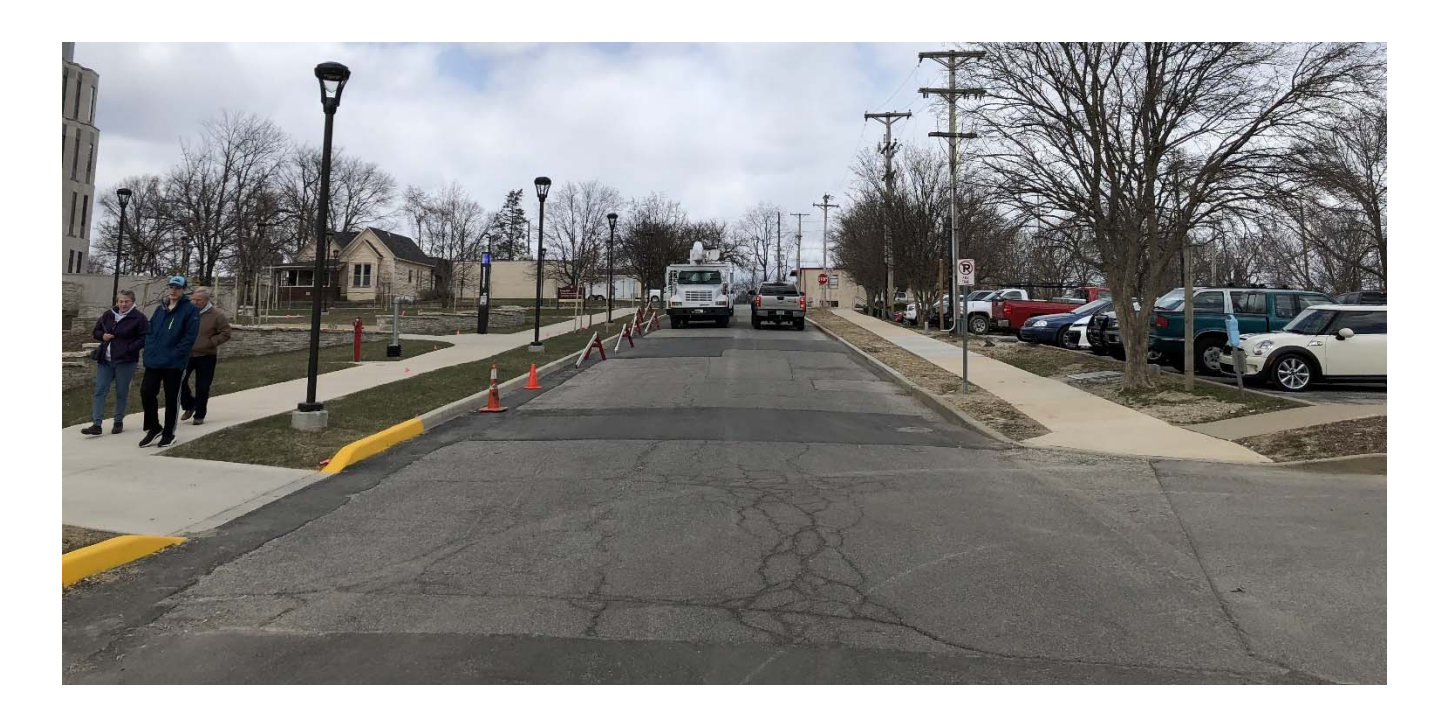
Looking north on N. Forrest Ave, 2018