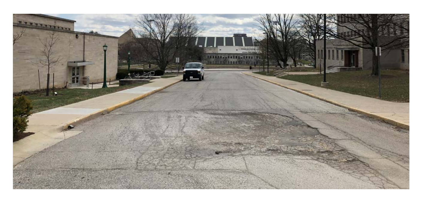
Looking south on N. Walnut Grove St, 2018