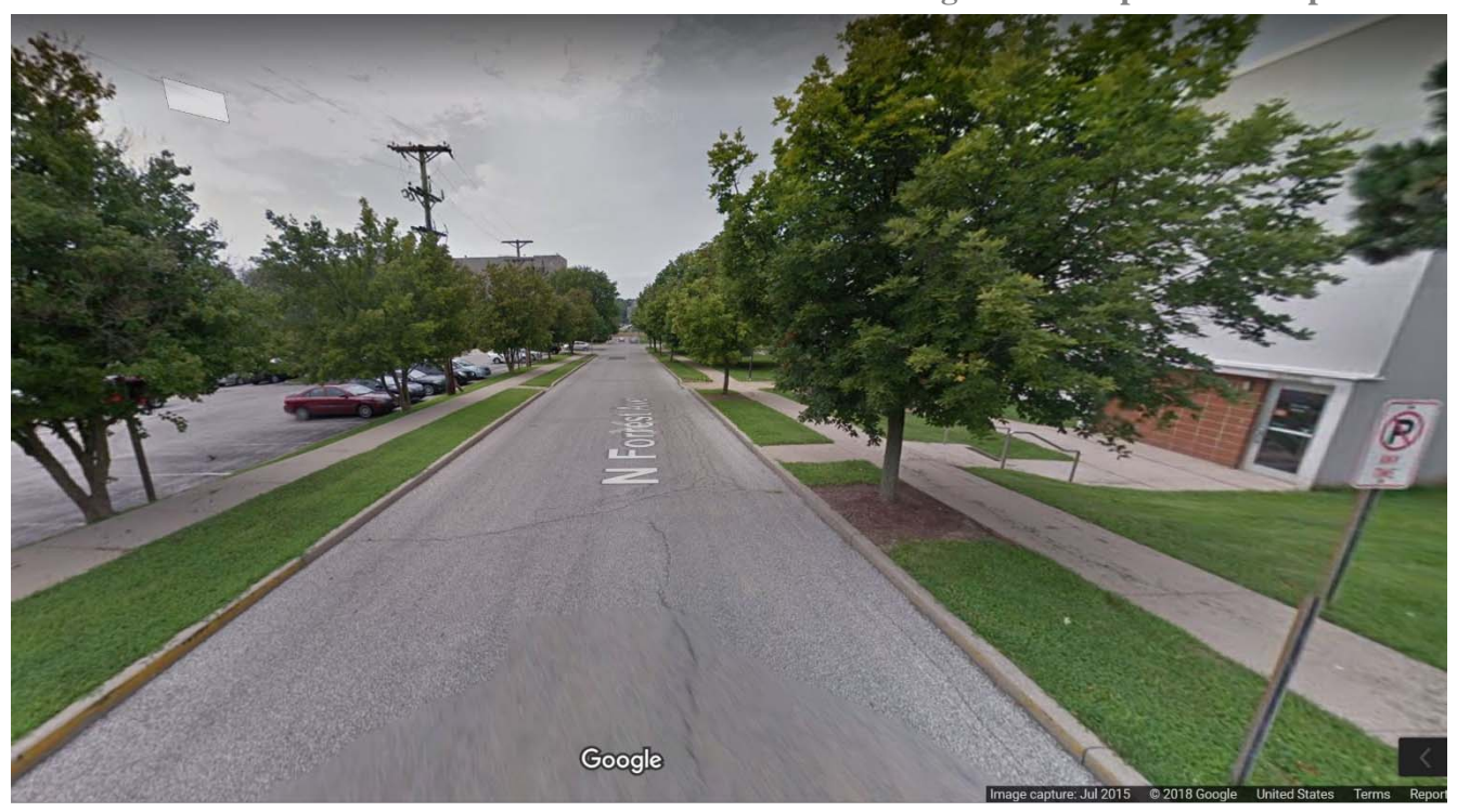
Looking south on N. Forrest Ave, 2015