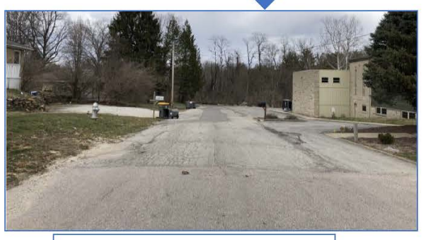
Looking north on E Martha St

The street width is between 19 and 20 feet.