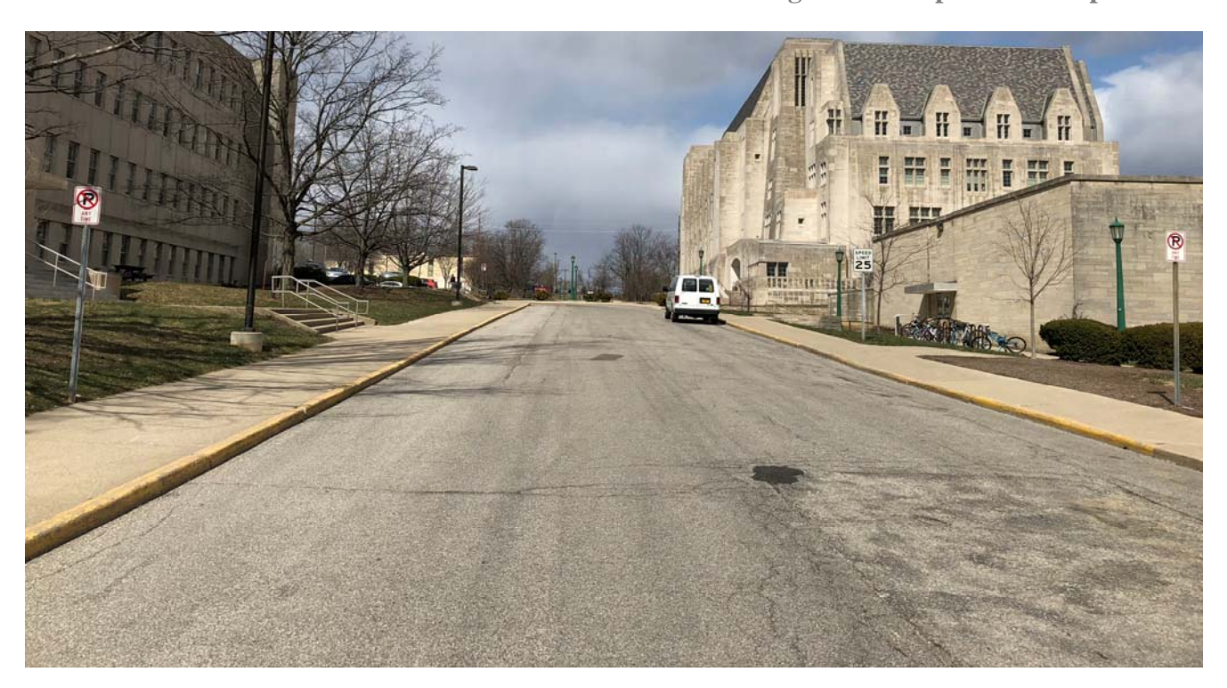
Looking north on N. Walnut Grove St, 2018