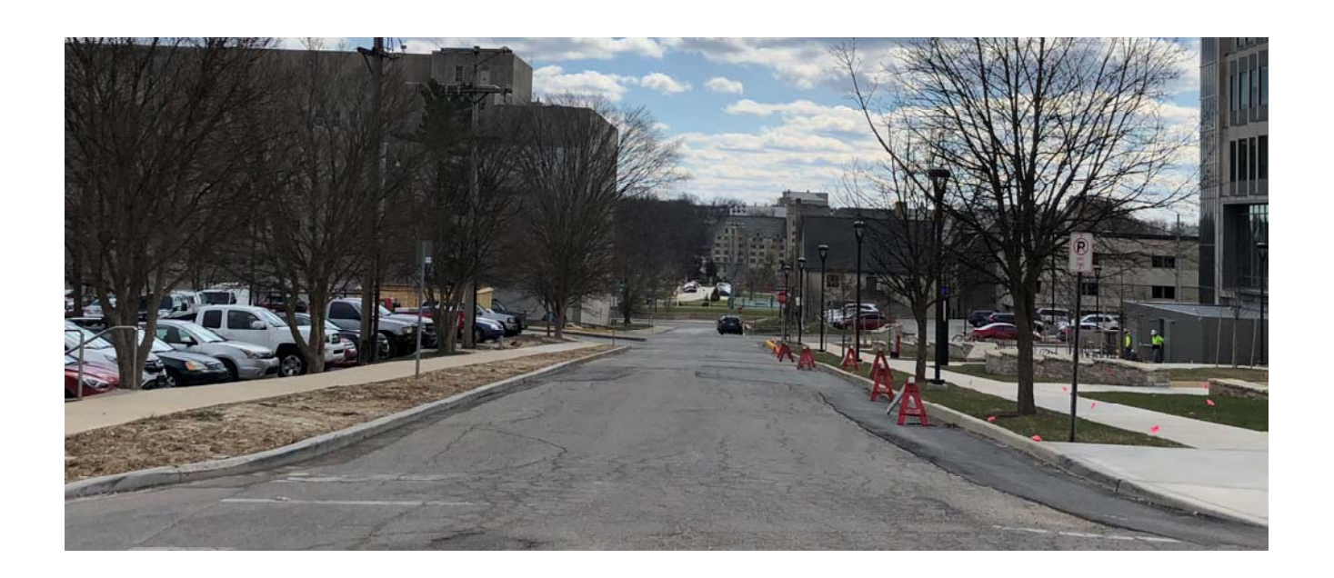
Looking south on N. Forrest Ave, 2018