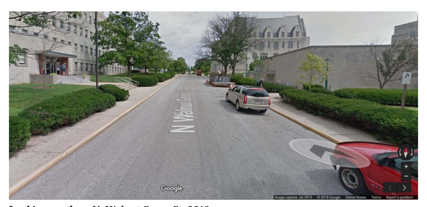
Looking north on N. Walnut Grove St, 2015