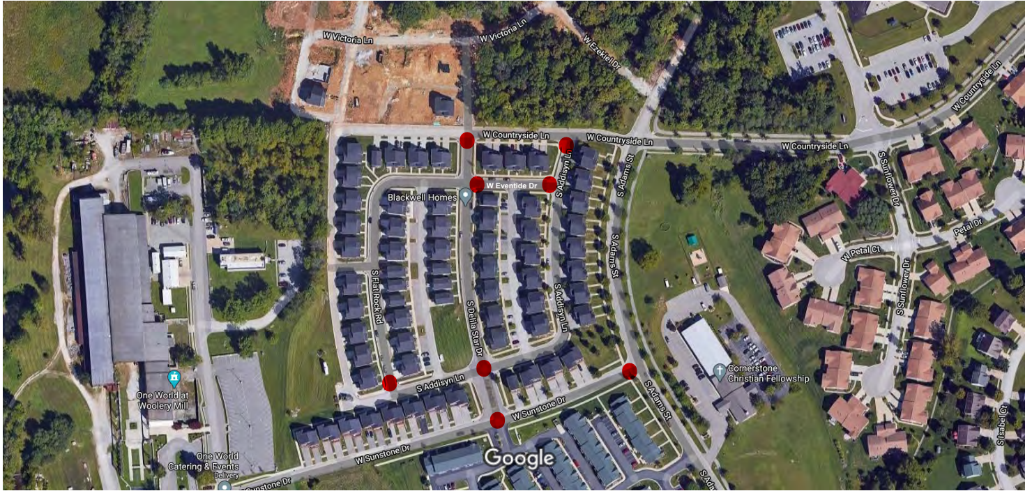
100 ft

To South Addisyn Lane at West Countryside Lane and at South Delila Star Drive, to S. Delila Star Drive at West Countryside Lane and at West Sunstone Drive, to West Eventide Drive at South Addisyn Lane and at South Delila Star Drive, to South Flat Rock Road at South Addisyn Lane and to West Sunstone Drive at South Adams Street.