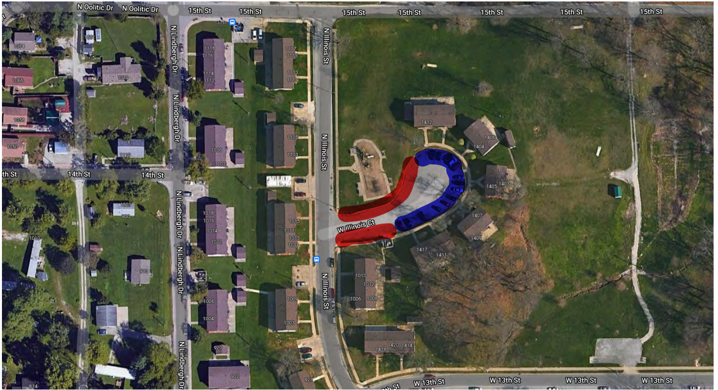
Angle Parking Sketch