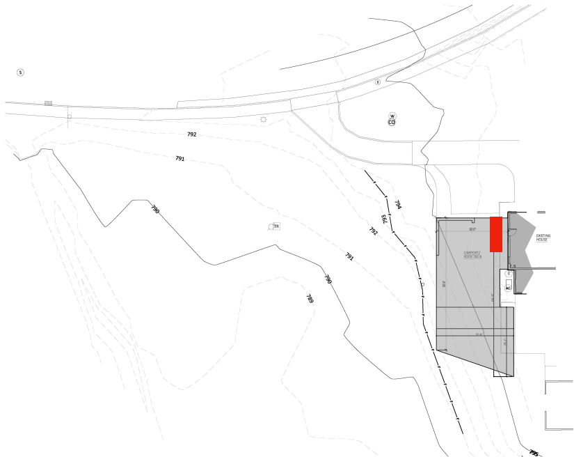
SITE PLAN SCALE: 1" = 20'-0"