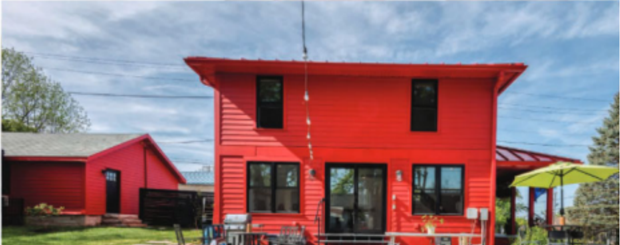
3. Drawing of Alley-Facing Elevation of Proposed Addition (Taken from original professional architectural drawings previously approved by the Monroe County Building Department)

Exterior of renovated home using Hardie cement board, double-hung windows, and Firestone steel roof panel system with standing seams, guttering, and downspouts. Addition will be located between the original structure and original garage.