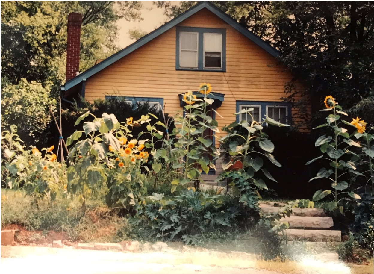
324 N Jefferson St Primary façade, from the Jean-Paul Darriau papers at the Indiana University Archives, 2003.

Staff Recommendation: Staff Recommends release of DD.