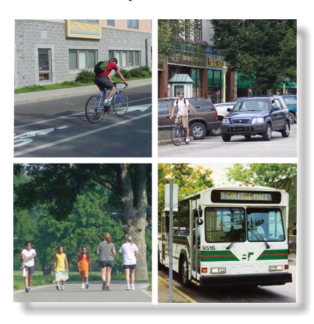
...then get involved with the Bloomington/Monroe County MPO!