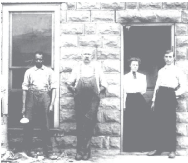
Workers at P.B. Martin Creamery about 1910