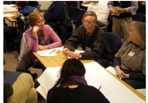
Community members attend public workshops to provide input on the CMP.

To learn more about the CMP, please visit bloomington.in.gov/cmp . There you can read the draft CMP, see a complete listing of every public comment that has been received and participate in UserVoice, an on-line discussion forum focusing on CMP topics.