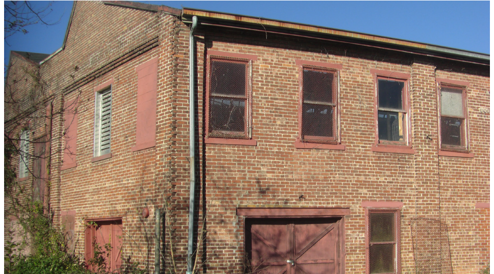
The former Showers Dimension Mill, a historic building on Morton Street north of City Hall, is envisioned to be a City owned co-working space. This will allow entrepreneurs and small startups to work in proximity to one another to advance ideas and create networks that could benefit the larger Bloomington business community.

planning@bloomington.in.gov www.bloomington.in.gov/planning facebook.com/bloomingtonplanning