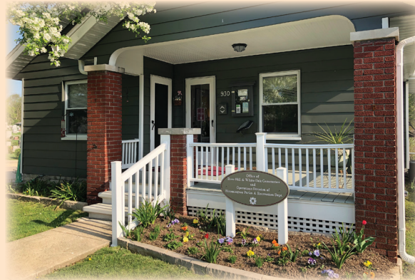
The Rose Hill and White Oak Cemetery office is located at the corner of Fourth and Elm Streets (930 W. Fourth St.), just outside the entrance of Rose Hill Cemetery.