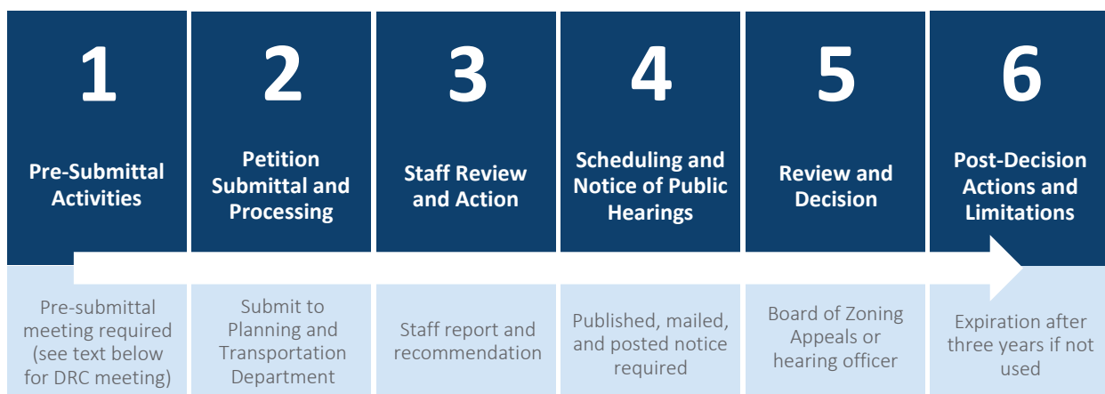
Figure 06.08-1: Summary of Variance Procedure

Figure 06.05-3 identifies the applicable steps from 20.06.040 (Common Review Procedures) that apply to variance review. Additions or modifications to the common review procedures are noted below.