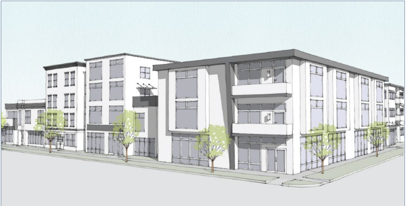
Figure 31: Illustrative Scale and Character

The Mixed-Use Downtown Core (MD-DC) character area is intended to draw upon the design traditions exhibited by historic commercial buildings by providing individual, detailed storefront modules that are visually interesting to pedestrians, and to promote infill and redevelopment of sites using residential densities and building heights that are higher in comparison to other character areas within the downtown.