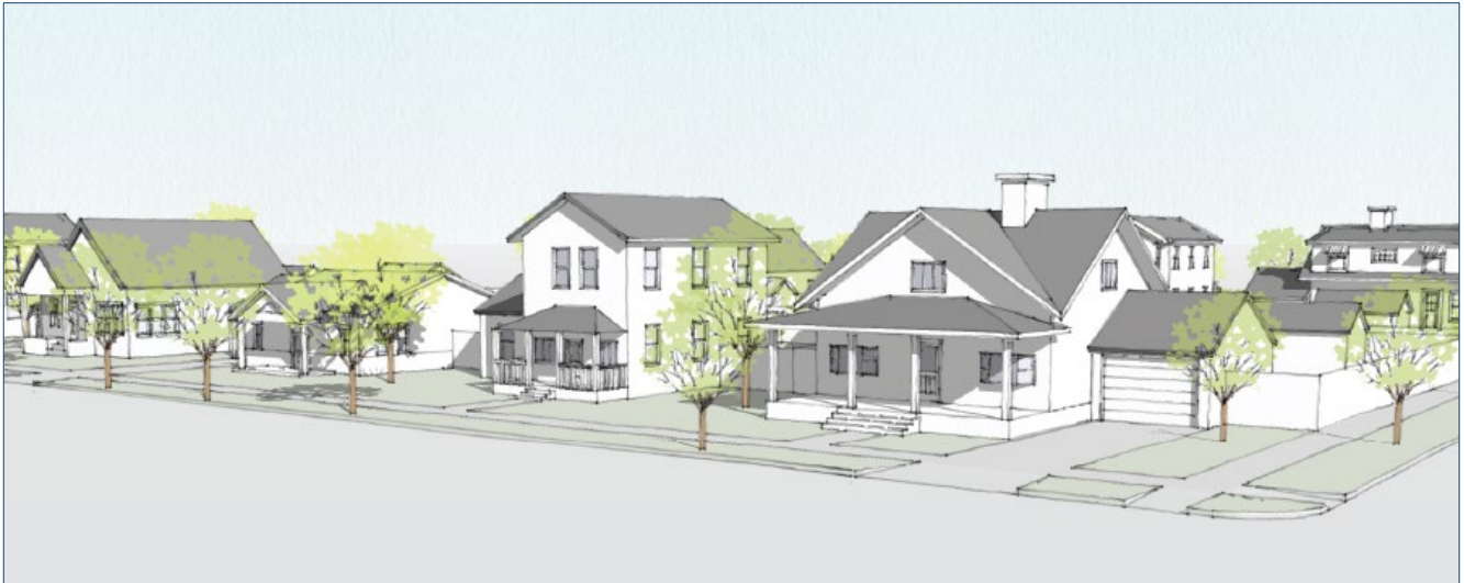
Figure 5: Illustrative Scale and Character

The R2 district is intended to accommodate residential development on medium-sized lots in single-family neighborhoods, plus a limited number of related civic uses, while ensuring compatibility with surrounding patterns of development. This district may be used as a transition between large-lot residential development and small-lot residential development.