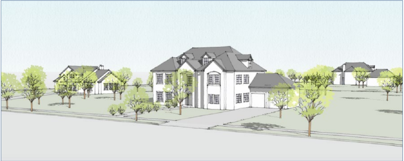
Figure 1: Illustrative Scale and Character

The RE district is intended to provide residential development on large lots while allowing for limited agricultural and civic uses and protecting sensitive environmental resources.