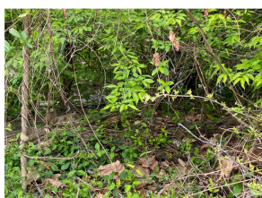
Clear Creek west of Rose Hill Cemetery