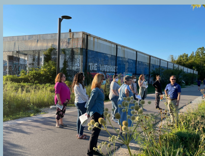
Parks & Recreation tour of Switchyard Park.