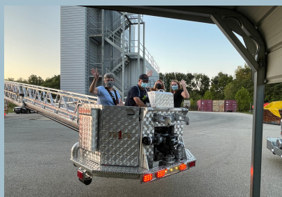
Participants go for a ride in the basket of the BFD 100-foot aerial ladder truck.