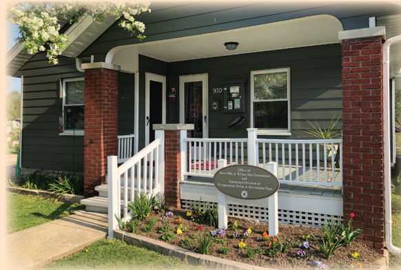
The Rose Hill and White Oak Cemetery office is located at the corner of Fourth and Elm Streets (930 W. Fourth St.), just outside the entrance of Rose Hill Cemetery.