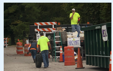
2020 Neighborhood Cleanup in Blue Ridge