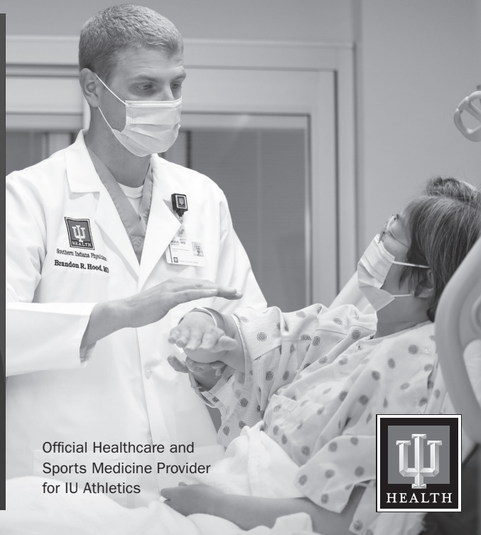
Official Healthcare and Sports Medicine Provider for IU Athletics

Call IU Health Orthopedics at 812.333.BONE