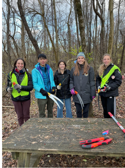
Bloomington High School South student volunteers at Winslow Sports Complex