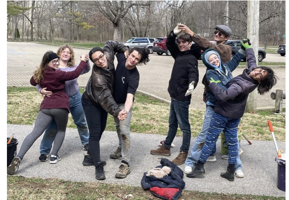
Weed wrangle volunteers from IU Ballroom Dance at Lower Cascades Park