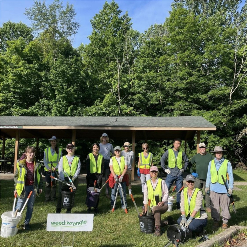
Parks staff and MC-IRIS volunteers at a Winslow Woods Park weed wrangle