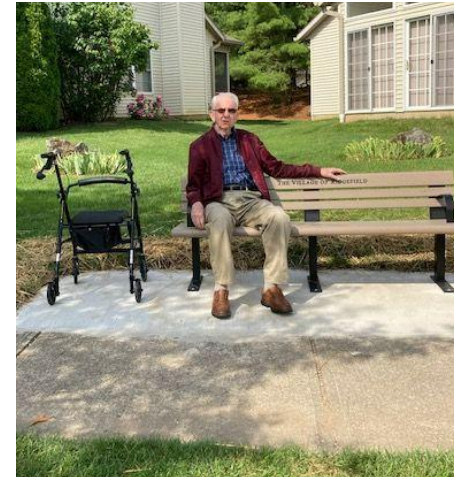
Village of Ridgefield Community Bench Project 2021