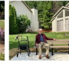
Village of Ridgefield accessible community benches