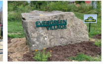
EverGreen Village neighborhood entrance sign