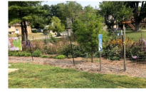
Park Ridge East butterfly garden