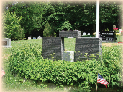
The Indiana Pioneers Memorial and the White Oak Cemetery limestone sign.

There is a memorial to Indiana pioneers that lists those graves and small cemeteries thought to have been lost during the expansion of Bloomington Township. The four foot tripartite monument of gray granite was dedicated by the Bloomington Township Trustees in 1989.