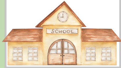
Stop 1 - School